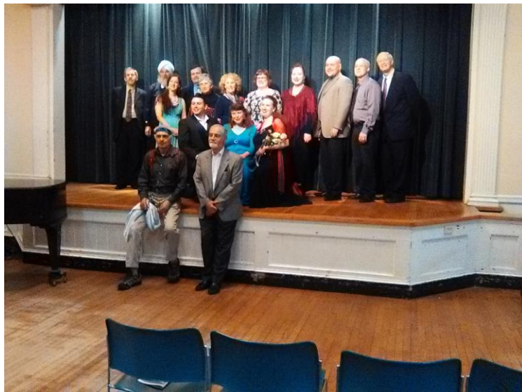
2017 Music to Cure MS performers and composers